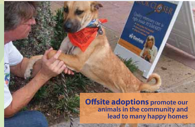
Offsite adoptions promote our animals in the community and lead to many happy homes

We take in over 1,600 dogs and cats per month - help reduce this number by spaying and neutering your own pets