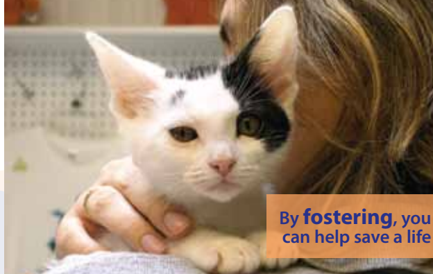
By fostering, you can help save a life