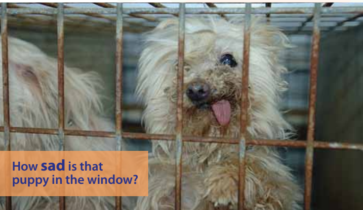
How sad is that puppy in the window?

A "puppy mill" is a breeding facility where dogs are bred purely for profit in large numbers. Puppy mills are distinguished by their inhumane conditions and the constant breeding of unhealthy and genetically defective dogs solely for profit. Puppies are often taken from their mother when they are 5 to 8 weeks old and sold to brokers who pack them in crates for resale to pet stores all over the country. The breeding dogs at the puppy mills are kept in small wire cages for their entire lives. They are almost never allowed out, and never allowed to touch solid ground or grass to run and play. If people in Texas refused to buy a puppy in a pet store, the misery of puppy mills in our state would end.